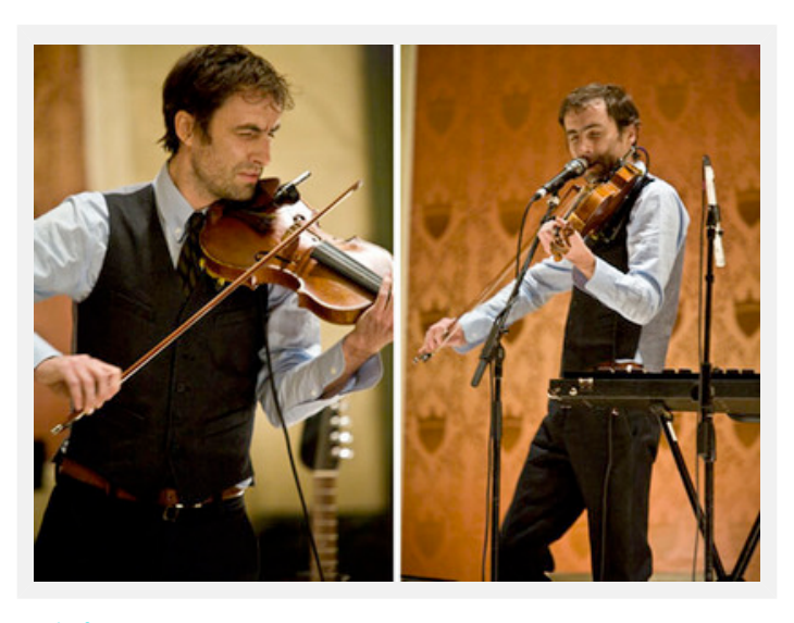
Speak of me in present tense.