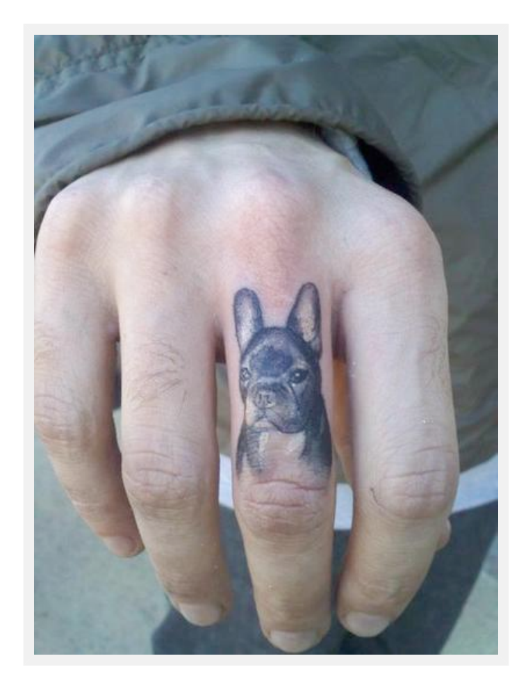
I need one of Hoolie!