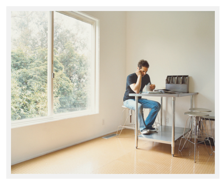
This is me!!!