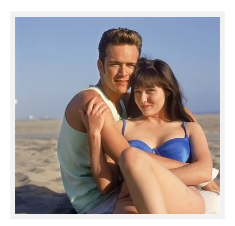
Currently the wallpaper on my Iphone!!!